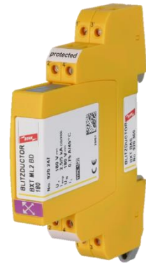
Combination conductor module (Typ1+2)

The combination conductor modules feature integrated RFID technology. This permits detection and non-contact transmission of thermal and electrical overload states in the conductors to a diagnosis module. The combination conductor modules have the capability to detect any deterioration in the condition of the integrated elements and to generate a signal to the diagnosis module before the element develops a fault. The diagnosis modules themselves feature potential-free contacts which can be integrated into the level-crossing control system's higher-level diagnosis system. This makes it possible to minimise disruptions to operation.