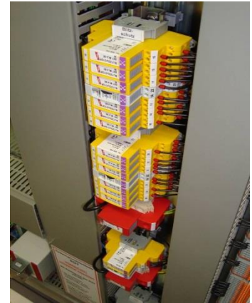
Lightning protection system on CTR

The introduction of this lightning-protection concept on DB Netz AG systems demonstrably enhanced system availability. The costs of implementation of this lightning-protection concept are low compared to the costs of damage to systems caused by spikes. In addition, the operator has a flexibly usable protection solution which can be implemented without modifying the existing earthing (grounding) concept.