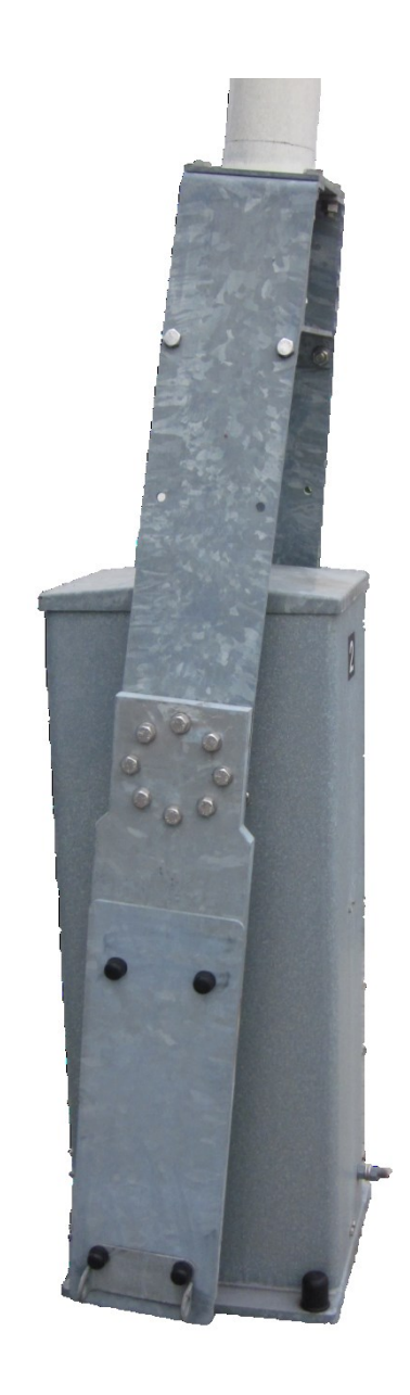
SPK10-10 barrier drive

The barrier can also be opened/closed manually if necessary. In this case, the supply lines to the motor and retaining magnet are interrupted by means of a locking switch. The boom can then be moved manually.