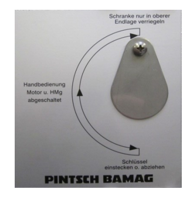
Locking mechanism notice plate