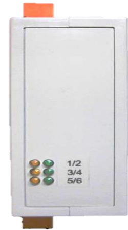
Fü-RU relay converter

Constant conditions in order to permit transmission across distances of more than 6.5 km are made possible in the Fü-RU relay converter on the basis of constant current sources on the cores of the Fü interface in the lineside cables. Under ideal conditions, a maximum actuation distance of 32.5 km is thus possible with a core diameter of 1.4 mm.